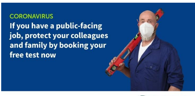
OXFORDSHIRE COUNTY COUNCIL

The aim is to get cases as low as possible so that we can gradually emerge from lockdown with the confidence that COVID-19 will not restrict our lives in the same way. The latest COVID-19 figures can be viewed on the county council's interactive dashboard , which is updated on a daily basis.