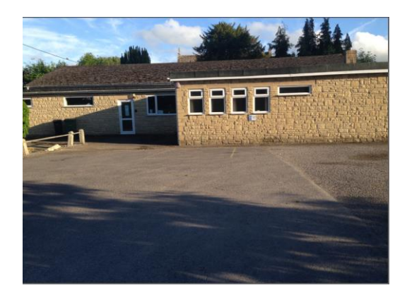
Main Hall – with Sprung Floor and Separate Stage.